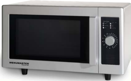
Model RMS510D shown