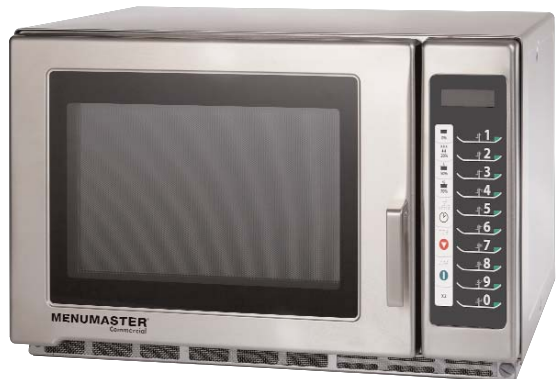
Model RFS518TS shown