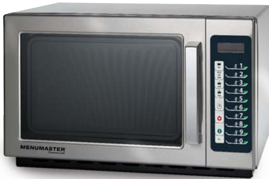
Model RCS511TS shown