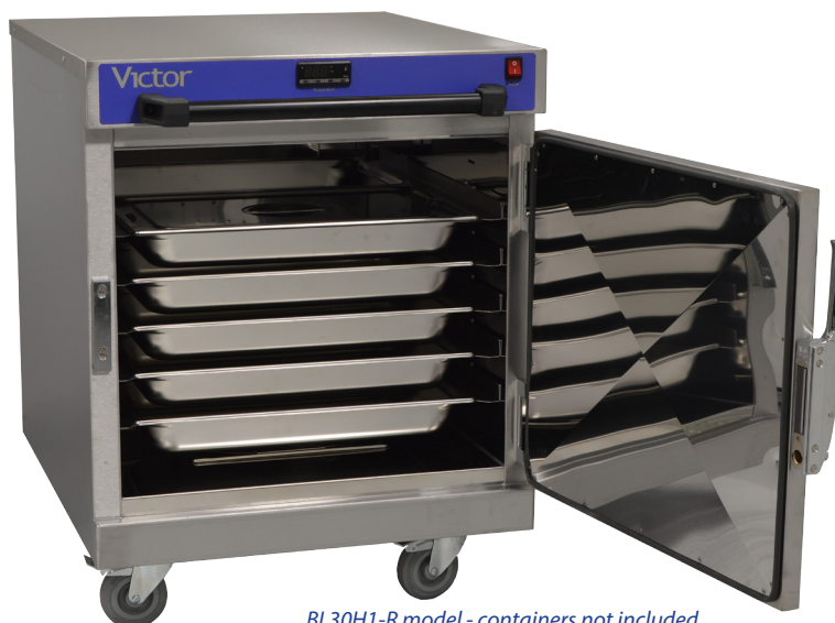
BL30H1-R model - containers not included

Gastronorm containers Additional shelves and supports Plate covers