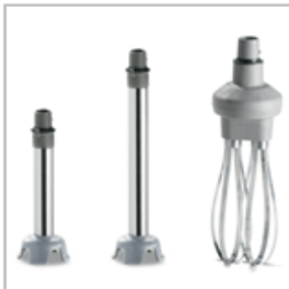
Shafts and Whisk