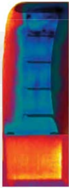
*Thermal image showing display temperatures. Shelves have been shaded for illustration.