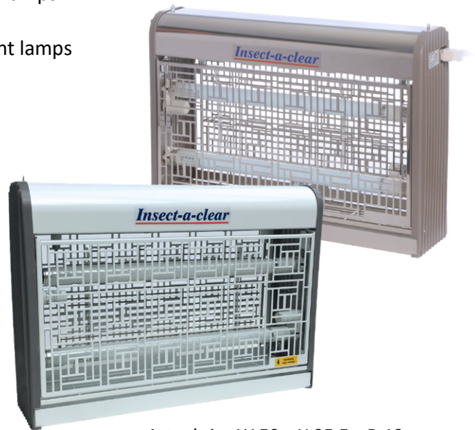
Actual size W 50 x H 35.5 x D 12 cm

The Nano H30 is a professional UK manufactured high voltage grid insect control machine suitable for restaurants, kitchens, food shops etc. where flying insects pose a problem. After the insects have been attracted by the high output UVA lamps, and killed by the high voltage grid, they can be quickly and hygienically disposed of in the large catchment tray. Made for wall mounting, suspending or free standing; the 'lift and lock' front guard enables tools free servicing. With competitive pricing and the option of white or stainless steel, make this a very popular model.