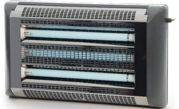
Actual size W 59 x H 35 x D 10.5 cm

All machines are fitted with high output Quantum lamps.