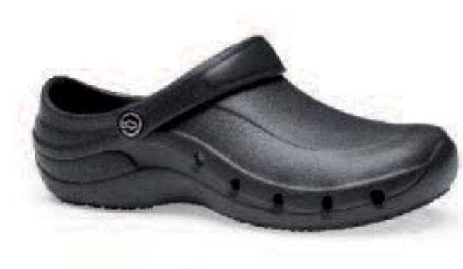
Ezi-Klog is made from lightweight E-tech™ material that is anti-bacterial, anti-microbial and recyclable