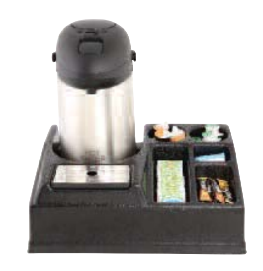
Pump Pots not included