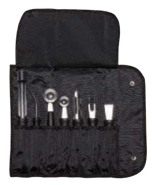
Tools not included