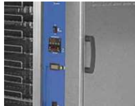
Manual or Automatic Control