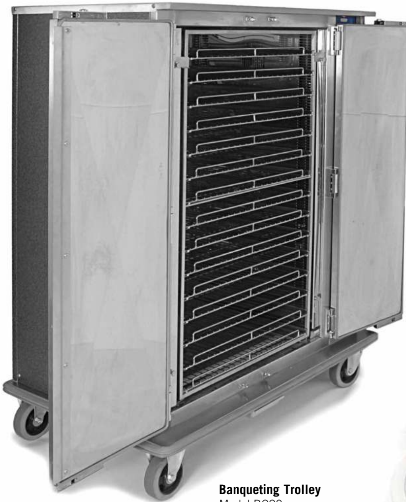
Banqueting Trolley Model BQ90

The Chillogen Banquet Trolley takes the hassle out of preparing for banquets and functions