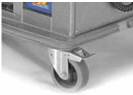
Precision Bearing Castors

Our optional 3D data logging system automates the process of testing and recording, saving you time and effort and ensuring proof of due diligence. The system automatically records the internal temperatures of the unit as well as logging actual food temperatures. The data can be stored on a personal computer.