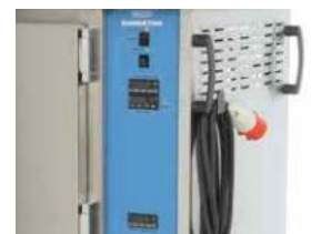
Manual or Automatic Control