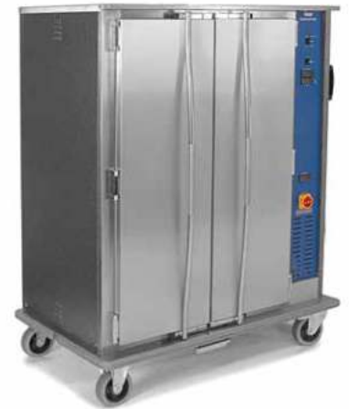
Banqueting Trolley Model BQ90

90 covers (based on 10" plates) 10" plates - 90 covers 11" plates - 75 covers 12" plates - 60 covers 13" plates - 60 covers