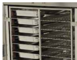
Pans or Rod Shelves