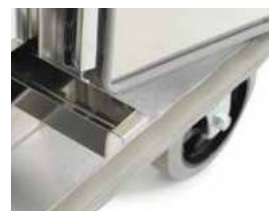
Pull out Water Trough for increased humidity