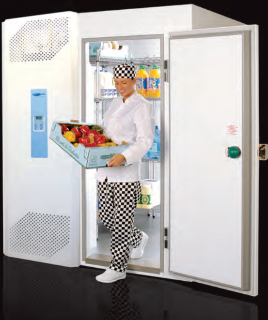
Product only available in the UK

These coldrooms bring Foster levels of performance and reliability to the Packaged Coldroom Market. The Commando Range comprises 20 off-the-shelf sizes from 4m 3 to 10m 3 capacities. Each package is available as either a floored or floorless refrigerated coldroom, or as a floored freezer coldroom.