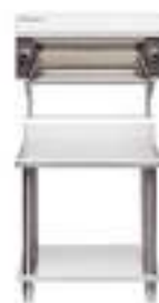
CS9 / C900-S