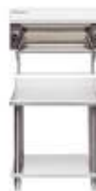
CS9 / C900-S