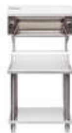
CS9 / C900-S