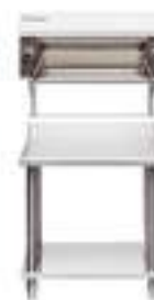
CS9 / C900-S