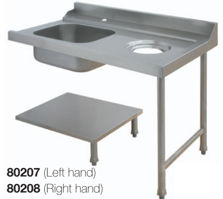
Closed end table c/w splashback, short undershelf, sink and scrap hole. 1200mm long supplied with rubber scrap hole protection ring. (Right hand as illustrated)