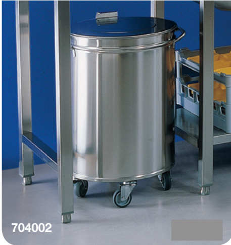
Stainless steel scrap bin c/w castors and lid