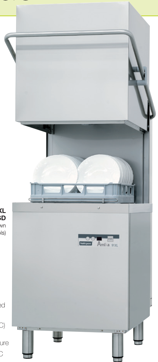
80 XL, 91 XL & 95 XL WSD (91 XL model shown with soft touch controls)