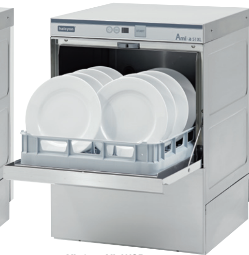
51 XL & 55 XL WSD