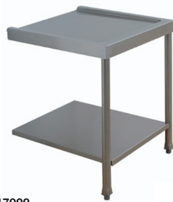
Closed end table c/w undershelf. 700mm long, 615mm deep