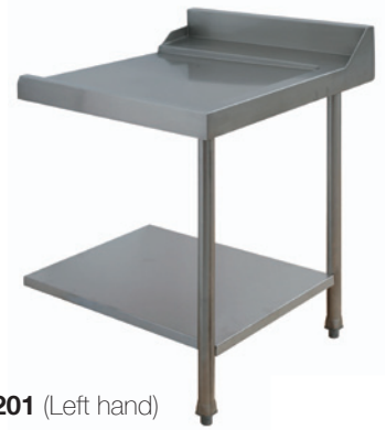
Closed end table c/w splashback and undershelf. 700mm long. (Right hand as illustrated)