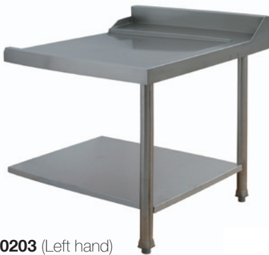
Closed end table c/w splashback and undershelf. 1200mm long. (Right hand as illustrated)