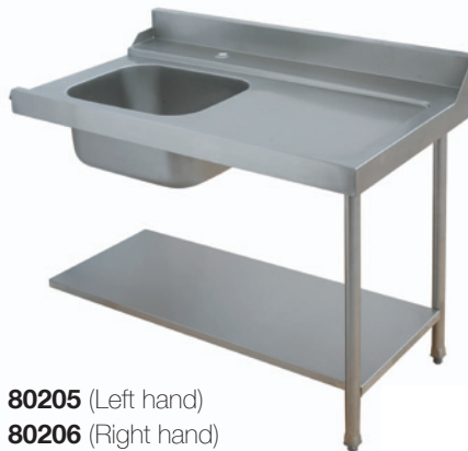
Closed end table c/w splashback, undershelf and sink. 1200mm long. (Right hand as illustrated)